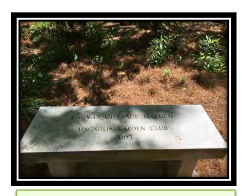
Bench dedicated to Laura's Cottage Garden by the Magnolia Garden Club in 2003.