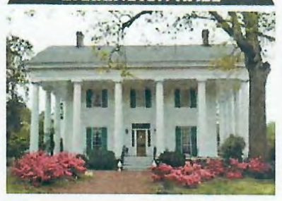
ROSWELL PRESBYTERIAN CHURCH