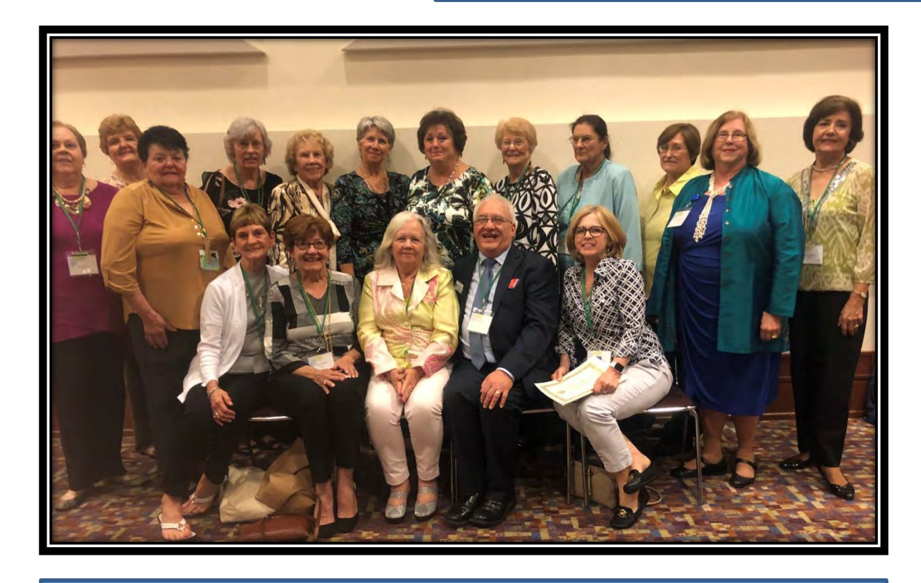
Group Photo of Laurel District members attending GCG Convention April 16-18, 2019 in Columbus.