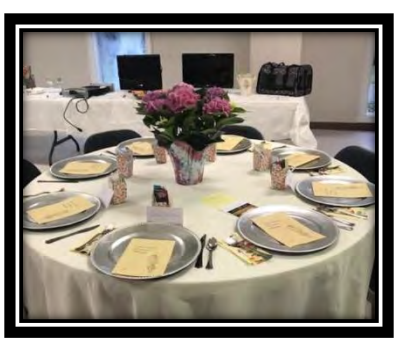
A sampling from our 11<sup>th</sup> Annual Tablescapes fundraiser.