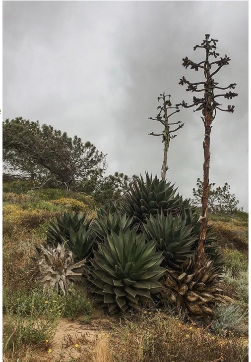
Agave shawii, Coastal Agave, in <u>Torrey State</u> <u>Nsture Reserve Pines CA</u>, is Globally imperiled. Only 2 known populations - 60 genetic individuals - remain in the wild in CA (http://explorer.natureserve.org)

For more information contact : arabellasd@aol.com