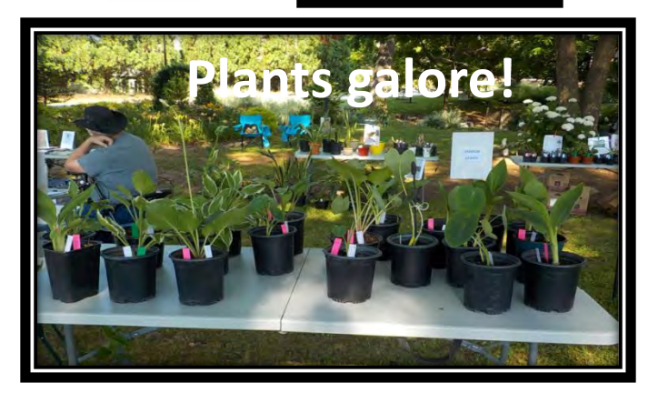
Many, many plants were loaded up for the customers.