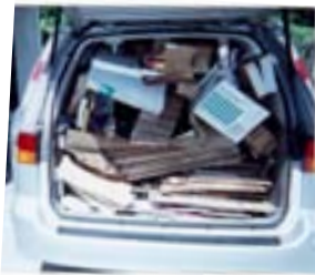
Spade & Trowel take a load of cardboard to the recycle center in Rome.

The two youth clubs that received certificates for participation were –