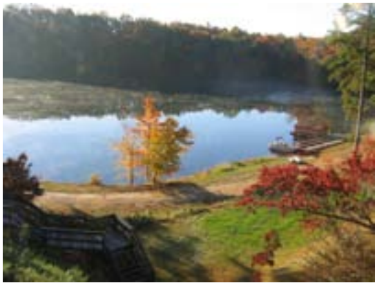
Pictured Above: Lake Louise at the Georgia Baptist Conference Center.