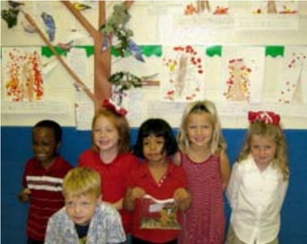
Pictured Above: The Bird Tree shown above is in the hallway.