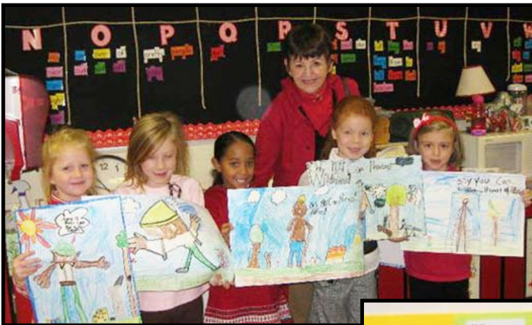
(above) Crabapple Garden Club (Gainesville) working with First Graders on posters for Woody Owl and Smokey Bear contest.

A special tour lunch (chicken salad on croissant, pasta salad, fruit skewer, dessert and beverage) will be available at a cost of $10.00. For more info, call 706-437-8833 or visit the GCG's web site: www.uga.edu/gardenclub . Come enjoy a day in Historic Waynesboro.